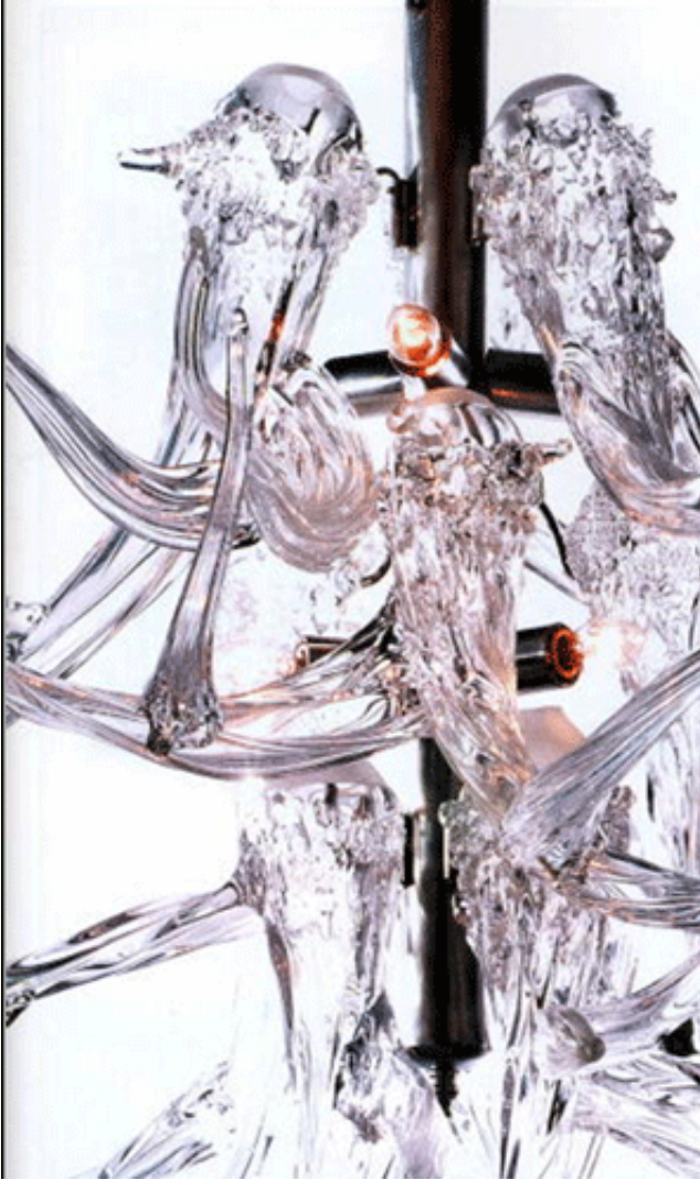
Detail, antler chandelier